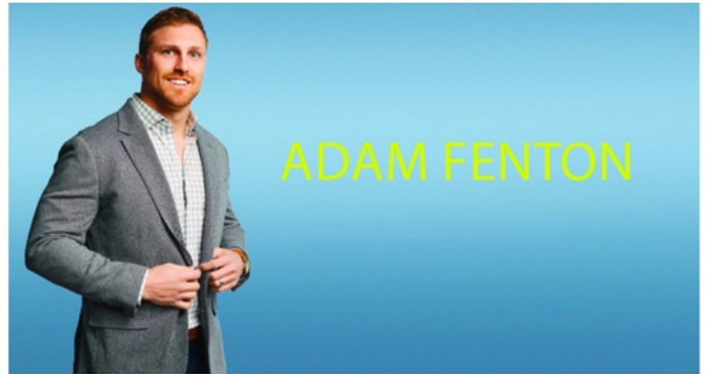
30 • CEO and Co-Owner • National Composites, Troy